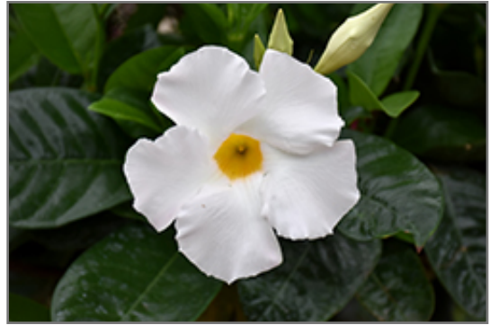
White Mandevilla flowers

This tropical plant does best in full sun to partial shade. It requires an evenly moist well-drained soil for optimal growth. It is not particular as to soil type or pH. It is highly tolerant of urban pollution and will even thrive in inner city environments. This particular variety is an interspecific hybrid, and parts of it are known to be toxic to humans and animals, so care should be exercised in planting it around children and pets. It can be propagated by cuttings; however, as a cultivated variety, be aware that it may be subject to certain restrictions or prohibitions on propagation.