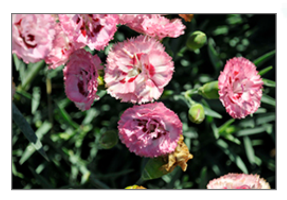
Pretty Poppers Appleblossom Burst Pinks flowers

Pretty Poppers Appleblossom Burst Pinks is recommended for the following landscape applications;