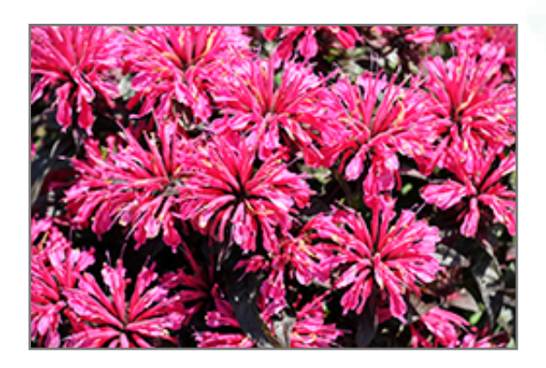
Sugar Buzz Berry Taffy Beebalm flowers

Sugar Buzz Berry Taffy Beebalm is recommended for the following landscape applications;