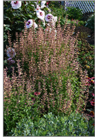
Meant To Bee Queen Nectarine Anise Hyssop in bloom

Meant To Bee Queen Nectarine Anise Hyssop is a fine choice for the garden, but it is also a good selection for planting in outdoor pots and containers. With its upright habit of growth, it is best suited for use as a 'thriller' in the 'spiller-thriller-filler' container combination; plant it near the center of the pot, surrounded by smaller plants and those that spill over the edges. It is even sizeable enough that it can be grown alone in a suitable container. Note that when growing plants in outdoor containers and baskets, they may require more frequent waterings than they would in the yard or garden.