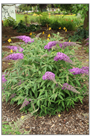
Lilac Cascade Butterfly Bush in bloom

Lilac Cascade Butterfly Bush is recommended for the following landscape applications;