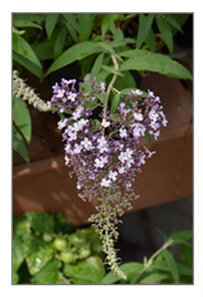
Lilac Cascade Butterfly Bush flowers