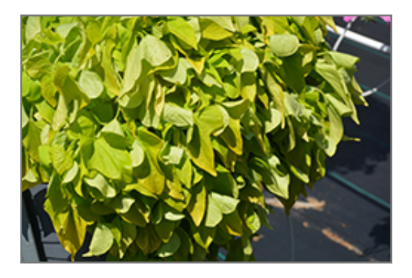
Floramia Limon Wedge Sweet Potato Vine foliage