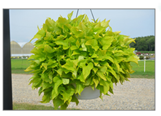
Floramia Limon Wedge Sweet Potato Vine

Floramia Limon Wedge Sweet Potato Vine is recommended for the following landscape applications;