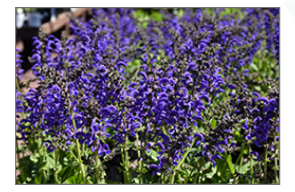
Fashionista Evening Attire Sage flowers