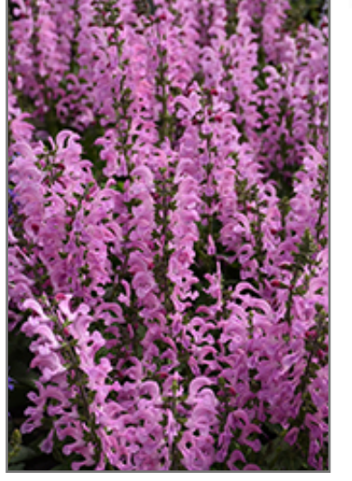
Fashionista Moulin Rouge Sage flowers