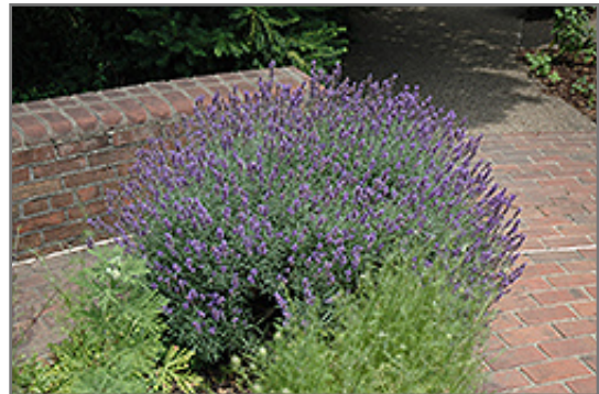
English Lavender in bloom

English Lavender is recommended for the following landscape applications;