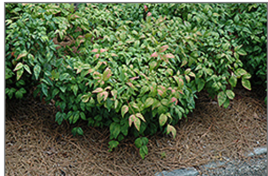
Fire Power Nandina