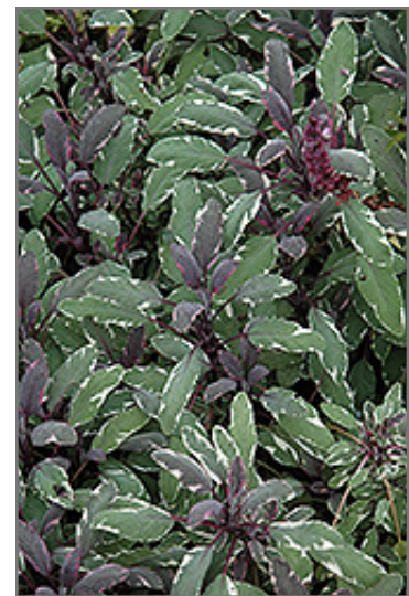
Tricolor Sage foliage