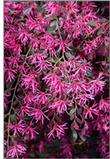
Plum Delight Chinese Fringeflower flowers

Plum Delight Chinese Fringeflower is recommended for the following landscape applications;