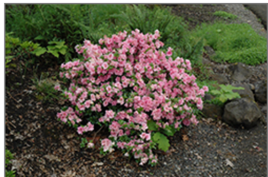
Gumpo Pink Azalea in bloom