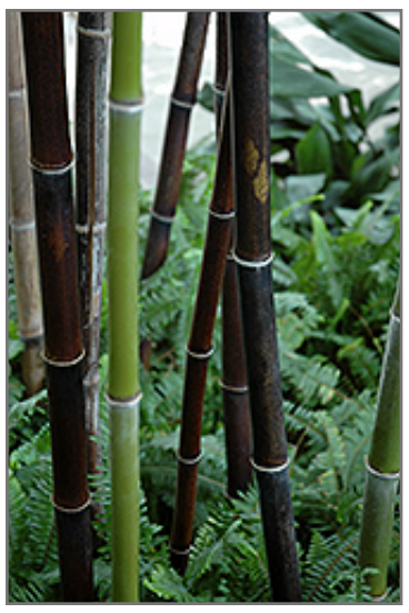
Black Bamboo bark

Black Bamboo is recommended for the following landscape applications;