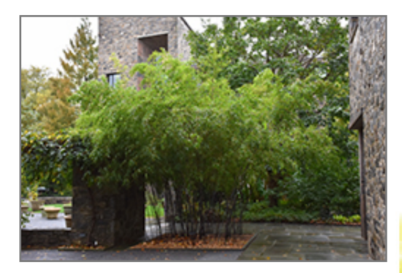
Black Bamboo