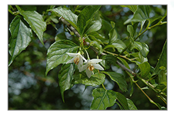
Fragrant Snowbell flowers

Fragrant Snowbell is recommended for the following landscape applications;