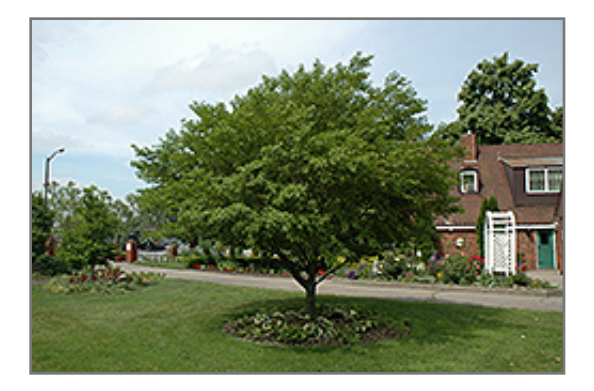
Fragrant Snowbell