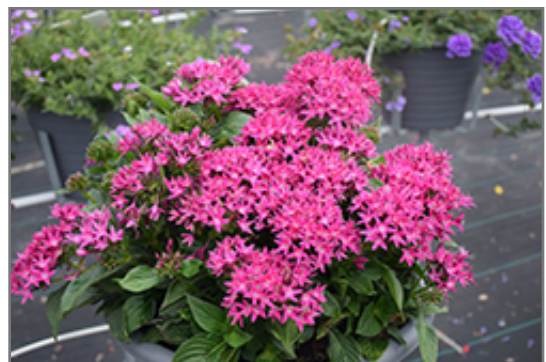
Sunstar Lavender Egyptian Star Flower in bloom