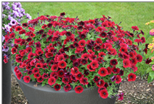
Supertunia Black Cherry Petunia in bloom