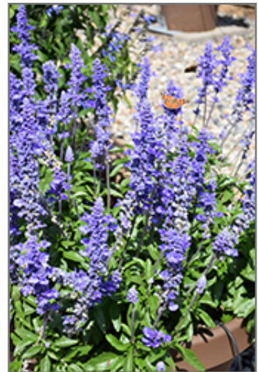
Unplugged So Blue Salvia flowers