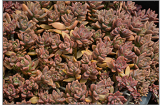
Vera Higgins Graptosedum

Vera Higgins Graptosedum is a dense herbaceous evergreen perennial with an upright spreading habit of growth. Its medium texture blends into the garden, but can always be balanced by a couple of finer or coarser plants for an effective composition.