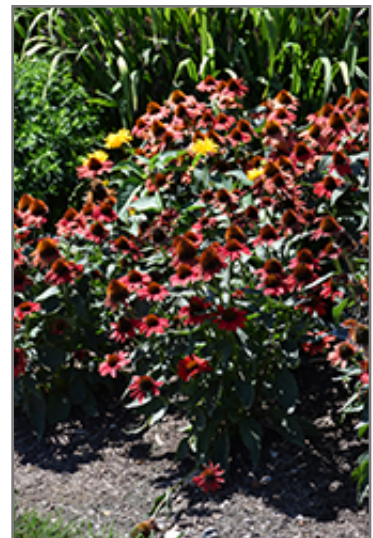
Color Coded Frankly Scarlet Coneflower in bloom