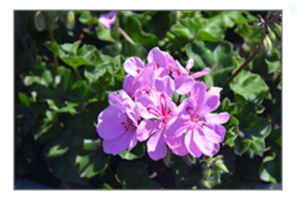
Ivy Leage Light Lavender Ivy Leaf Geranium flowers