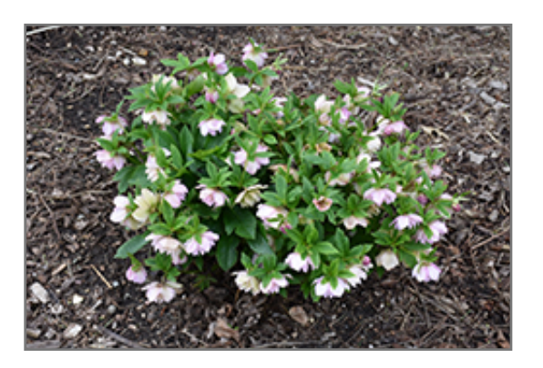
Wedding Party Flower Girl Hellebore in bloom

Wedding Party Flower Girl Hellebore is an herbaceous evergreen perennial with an upright spreading habit of growth. Its medium texture blends into the garden, but can always be balanced by a couple of finer or coarser plants for an effective composition.