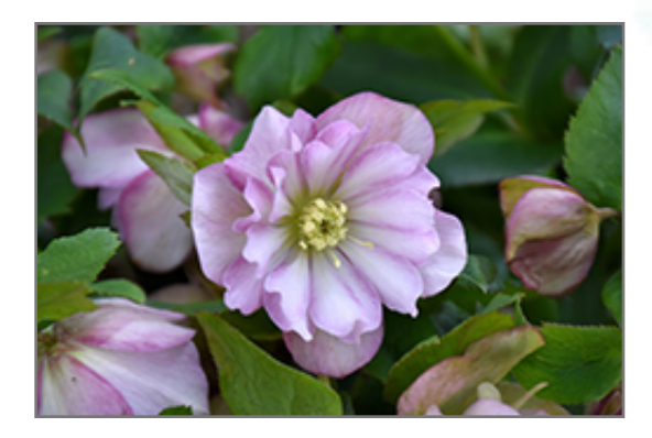
Wedding Party Flower Girl Hellebore flowers