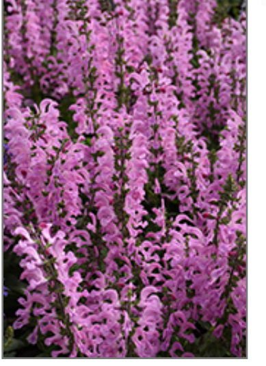
Fashionista Moulin Rouge Sage flowers